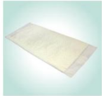
Sanitary Obstetric Pad