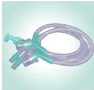
Breathing Circuit Smoothbore (adult/pediatric)