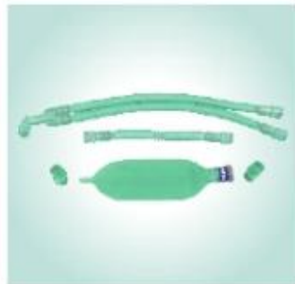
Anesthesia Breathing Circuit (adult expandable)