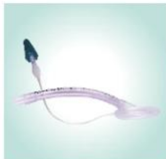
PVC laryngeal Mask Airway