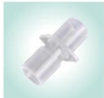
Straight Connector (15M-15M)