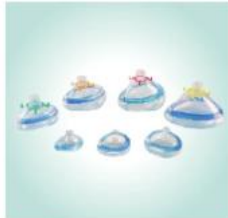
PVC Scented Anesthesia Mask