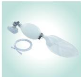
Manual Resuscitators (silicone)