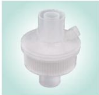
HME Filter (adult 20ml)