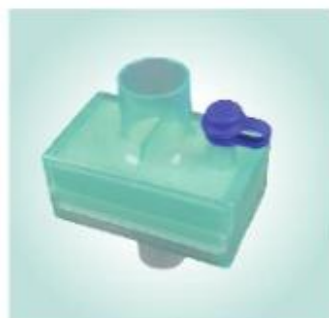
Bacteria and Virus Filter (35ml)