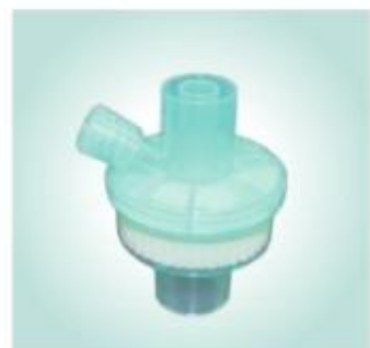
HME Filter (infant 8ml)