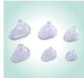
Silicone Anesthesia Mask