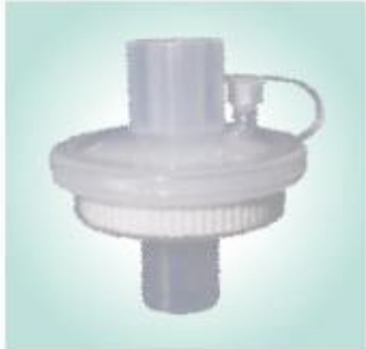
HME Filter (adult 20ml)