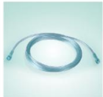
Oxygen Connection Tube