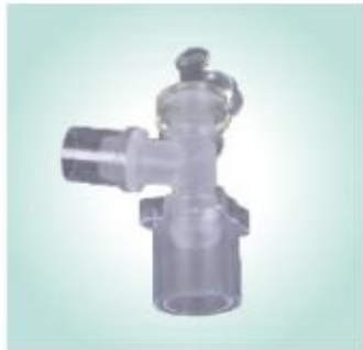
Elbow (double swivel)