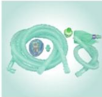
Anesthesia Breathing Circuit (adult corrugated)