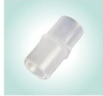
Straight Connector (22M-22M/15F)