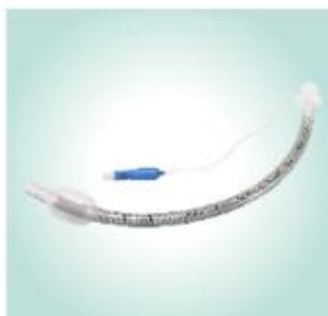
Endotracheal Tube Reinforced ( Cuffed )