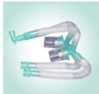
Breathing Circuit Expandable (adult/pediatric)