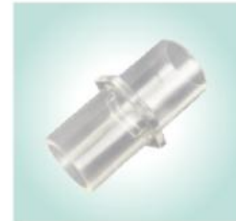
Straight Connector (15M-15M)