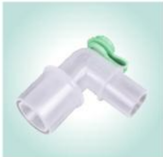
Elbow (with luer lock port & cap)