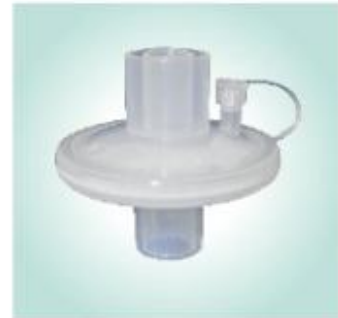
Bacteria and Virus Filter (25ml)