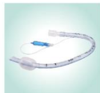
Endotracheal Tube Oral Preformed ( Cuffed )