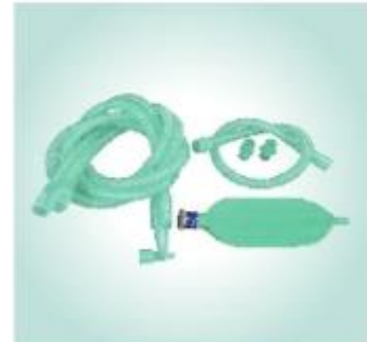
Anesthesia Breathing Circuit (adult corrugated)