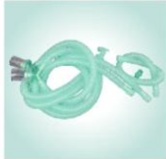
Breathing Circuit (adult corrugated)