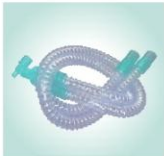
Anesthesia Breathing Circuit Smoothbore (adult/pediatric)