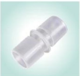
Straight Connector (22M-22M)