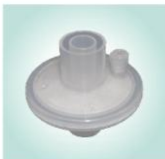
Bacteria and Virus Filter (25ml)