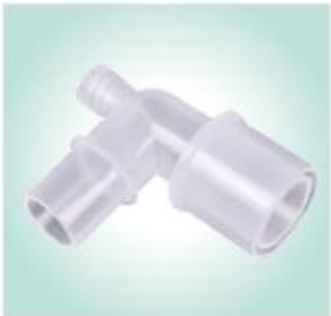
Elbow (with luer lock port & cap)