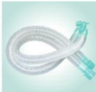
Anesthesia Breathing Circuit Corrugated (adult/pediatric)