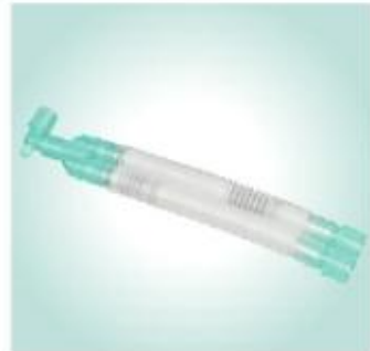
Anesthesia Breathing Circuit Expandable (adult/pediatric)