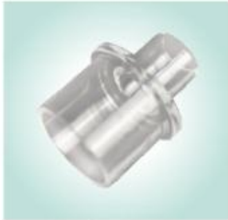
Straight Connector (15M-22F)