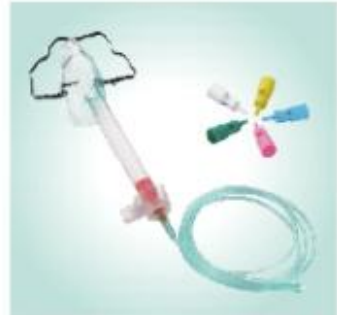
Adjustable Venturi Mask