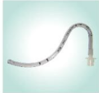
Endotracheal Tube Nasal Preformed (Uncuffed )