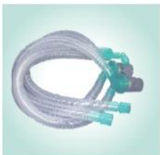
Breathing Circuit Corrugated (adult/pediatric)