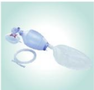
Manual Resuscitators (PVC)