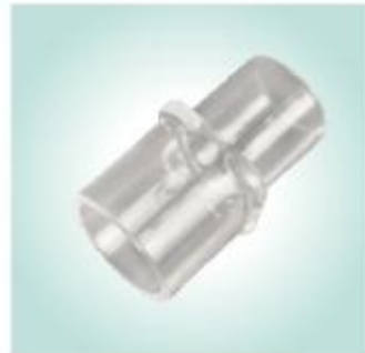
Straight Connector (15M-15F)