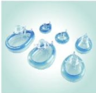
PVC Anesthesia Mask