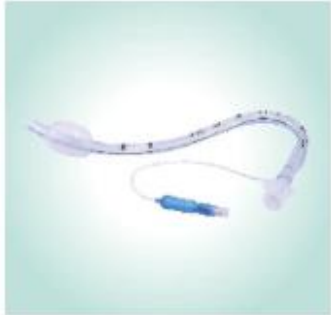
Endotracheal Tube Nasal Preformed (Cuffed )