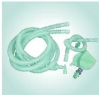
Anesthesia Breathing Circuit (pediatric corrugated)