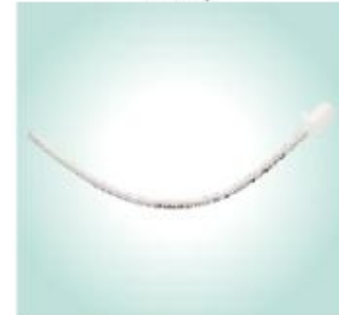
Endotracheal Tube Standard ( Uncuffed )