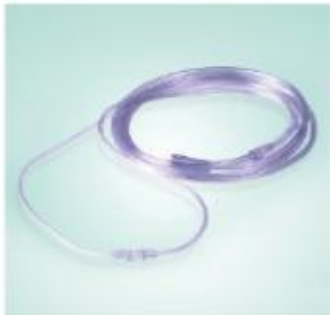
Nasal Oxygen Cannula