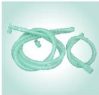
Anesthesia Breathing Circuit (pediatric corrugated)