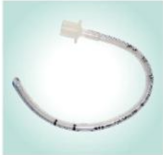
Endotracheal Tube Oral Preformed ( Uncuffed )