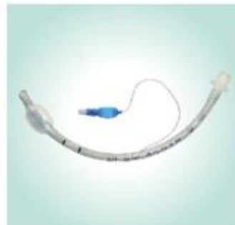
Endotracheal Tube Standard ( Cuffed )