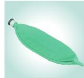
Latex Free Reservoir Bag