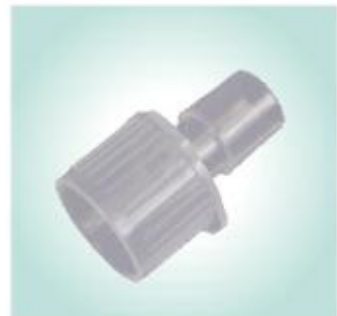
Straight Connector (15M-22F)