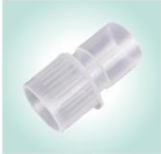
Straight Connector (22M-22F)