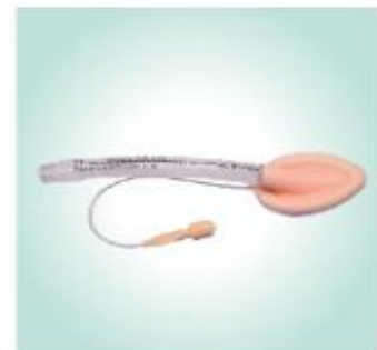
Silicone Laryngeal Mask Airway