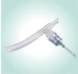
Nebulizer Kit with T Mouth Piece