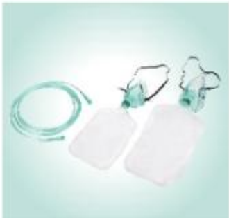
Non-rebreathing Oxygen Mask