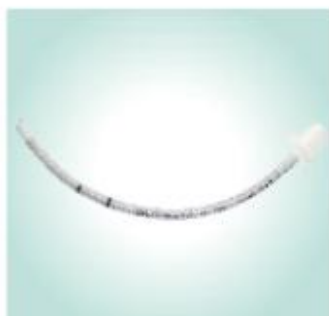
Endotracheal Tube Reinforced ( Uncuffed )