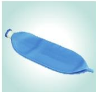
Latex Reservoir Bag