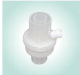
HME Filter (pediatric 12ml)