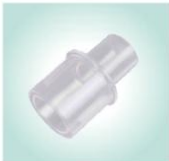
Straight Connector (15M-22M/15F)