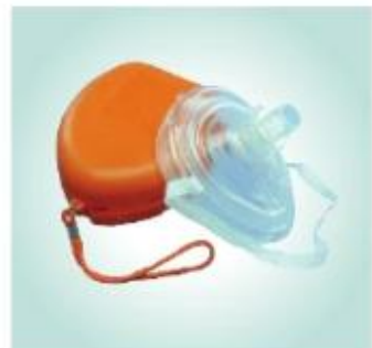
CPR Pocket Mask