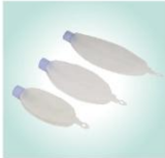
Silicone Rebreating Bag