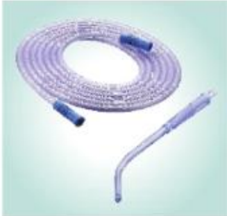
Yankauer Suction Set