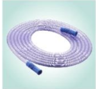
Suction Connecting Tube