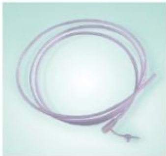
Infant Feeding Tube