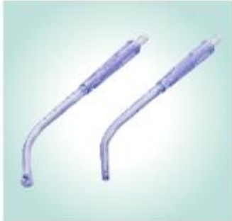
Yankauer Suction Tip