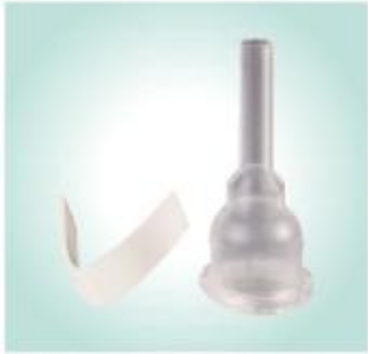
Silicone External Catheter