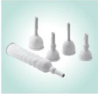
Latex External Catheter